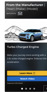
MOBILE - RETENTION