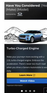
MOBILE - AUDIENCE